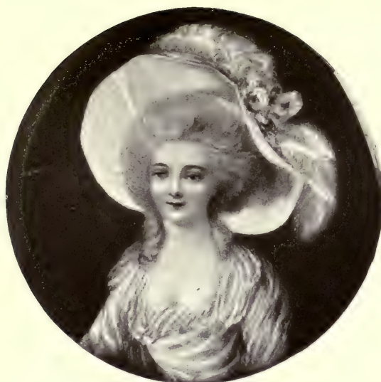
MADAME DUPIN (Ob. 1799) BY JEAN MARC NATTIER